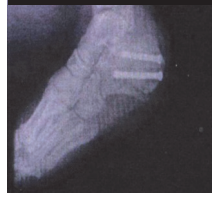
Internal fixation of calcaneus