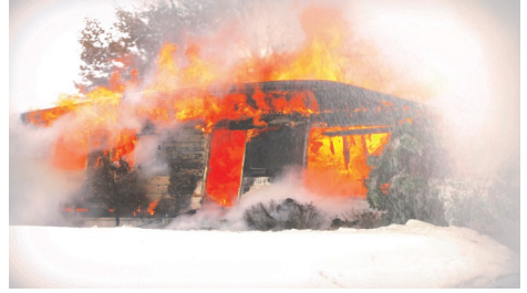
Trista’s St. Paul Home after the Gas Explosion

Our experts traced the explosion back to the employment of a dangerous gas line installation technique called “blind boring.” Blind boring was used by gas companies in the early 1990’s in an effort to relocate natural gas lines around the metro area. The process required no digging,